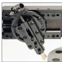
Adjustable tool block