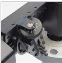
Tool bit fine depth adjustment.

ID mounting range: 25.4mm - 152.4mm (1" - 6") Flange OD facing range: 25.4mm - 304.8mm (1" - 12") Weight: 6.8kg (15lbs)